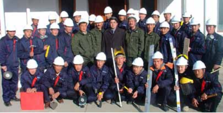
SPCE Bricklaying / Masonry, Construction Carpentry, and Plastering and Tiling learners at the opening of Naryn's Technical and Vocational Education Training (TVET) Centre in 2007.