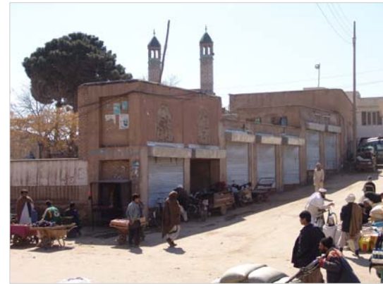
New shops in the precinct of Khirqa Mosque

Despite the fact that the Afghan conservation law specifically precludes any changes to historic buildings, staff of the department of Historic Monuments in Herat were unable to halt the illegal conversion work. Apart from violating the precinct of this historic mosque complex, this action sets a precedent for the commercialization of other religious sites in the city—where a significant proportion of shops remain empty and unlet. Efforts will continue to monitor this form of illegal 'development' and to lobby for enforcement of building controls.