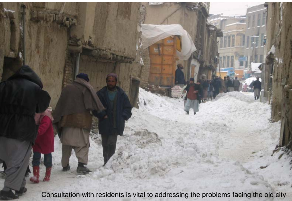
Consultation with residents is vital to addressing the problems facing the old city

The Minister went on to hold discussions with AKTC staff on a wider range of conservation issues, including measures to improve coordination of cultural activities in the country.