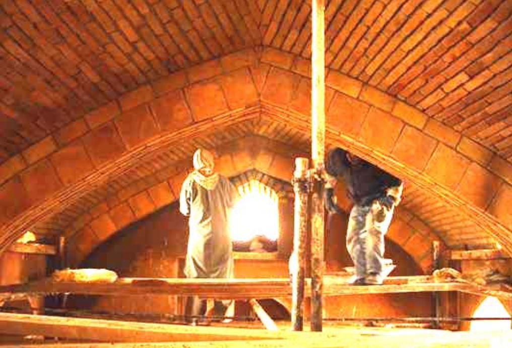
Masons finishing the brick arches and vaults in the main prayerspace