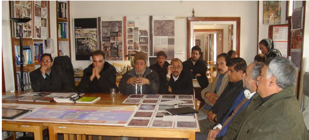
Participants were shown examples of upgrading and conservation initiatives that are under way in Asheqan wa Arefan and adjacent areas.

The importance of drawing on the resources and knowledge of communities in planning and upgrading work was discussed at length. Some participants felt that the current top-down approach towards planning has stifled local initiative.