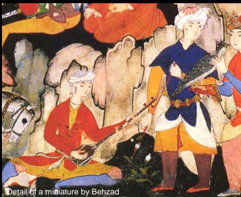
Detail of a miniature by Behzad

On a wonderful autumn evening during August, the courtyard garden of Qala Moeen Afzal Khan in southern Kabul was filled with the strains of the living cultural heritage of Herat, as six master-musicians from the city performed in front of an audience of Afghan and international guests. The event was organised by the Aga Khan Music Initiative in Central Asia (AKMICA) to mark the imminent opening of a branch in Herat of its school of traditional music. AKMICA's folk band 'Guldasta e Kharabat', whose members are drawn from across Afghanistan, also played, and the walled garden provided a backdrop for an exhibition of the surviving architectural treasures in and around the old city of Herat, some of which are being conserved by AKTC.