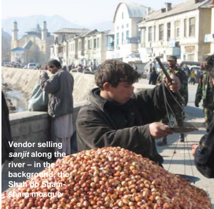
Vendor selling sanjit along the river – in the background, the Shah do Shamshira mosque