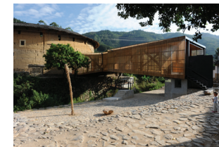
Bridge School Xiashi, Fujian Province, China

The recipients of the eleventh cycle Aga Khan Award for Architecture - including architects, clients and craftsmen - received awards from His Highness the Aga Khan and His Highness the Amir of the State of Qatar during a ceremony held at the Museum of Islamic Art in Doha, Qatar, on 24 November 2010.