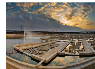
Wadi Hanifa Wetlands Riyadh, Saudi Arabia