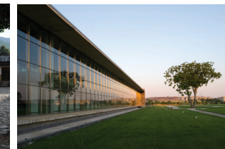
Ipekyol Textile Factory Edirne, Turkey