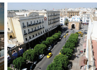
Revitalisation of the Recent Heritage of Tunis, Tunisia