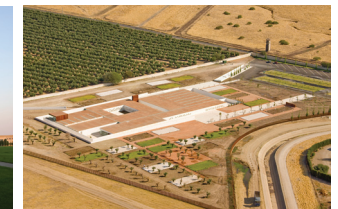
Madinat al-Zahra Museum Cordoba, Spain